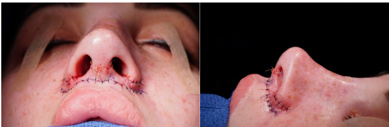
Figure 1: The incisions of open rhinoplasty, alar base reduction, and lip-lift.

To perform the lip-lift, the bullhorn design with excision of skin and Superficial Musculo Aponeurotic System (SMAS) was made. The amount of skin, that was excised, was customized based on the need to achieve over the center or more lift laterally of the lip. Also, alar reduction was performed in all patients. All of them involved complete through-and-through resection of alar wedge. The incisions of each cosmetic procedure are highlighted in detail in Figure 1.