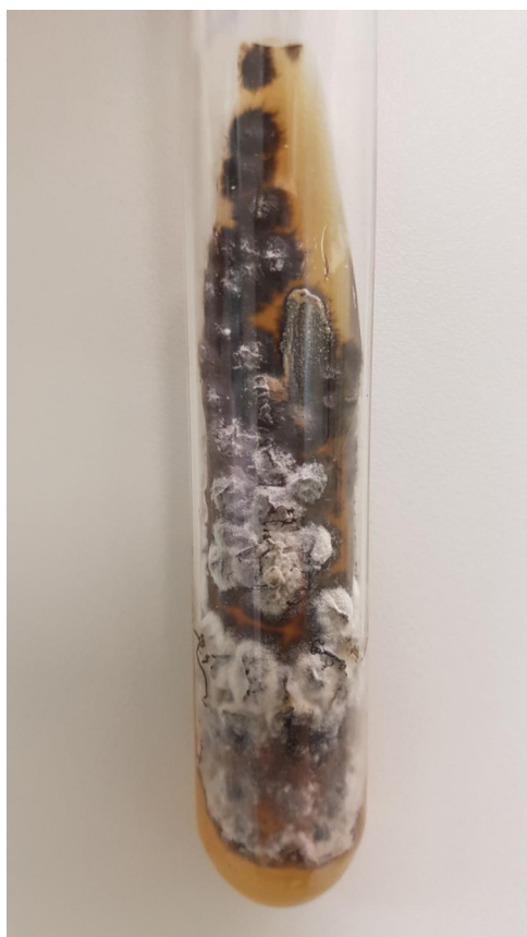
Figure 3 Ocular secretion culture in Sabouraud agar, showing the growth of a black and white filamentous colony.

by culture to screen for fungi. 1,2 The drugs indicated for sporotrichosis treatment are: itraconazole, potassium iodide, terbinafine, and amphotericin B. Ocular involvement in sporotrichosis should be treated with antifungals at the doses recommended for the cutaneous forms. The choice of the drug will depend on contraindications, availability and the host's clinical conditions. Itraconazole has been the first choice at a dose of 100 to 200 mg/day until complete resolution of the lesions (or for another 2 to 4 weeks), in general, for a total of 3 to 6 months. 1 Treatment duration varies in