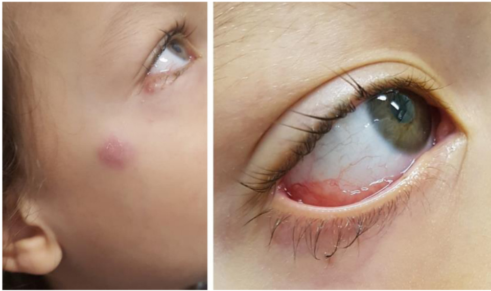
Figure 1 Clinical presentation of patient 1: granular erythematous lesion on the right lower tarsal conjunctiva and submandibular lymphadenopathy (Parinaud's oculoglandular syndrome).