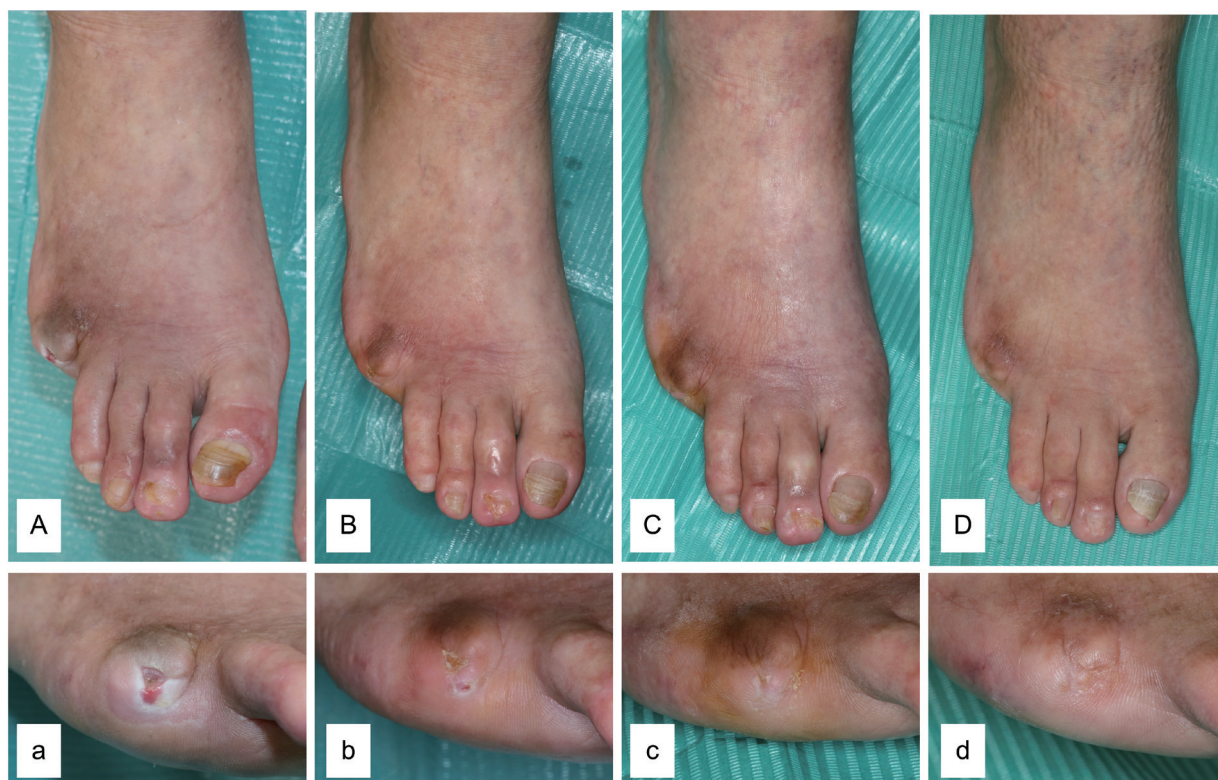
Fig. 4. Healing process of the right foot ulcer post-spinal cord stimulation.

A, a: 1 month, B, b: 3 months, C, c: 6 months, D, d: 12 months. The necrotic tissue gradually decreased, and tissue granulation gradually increased. There was no ulcer, and the color of the foot improved 12 months post-operation.