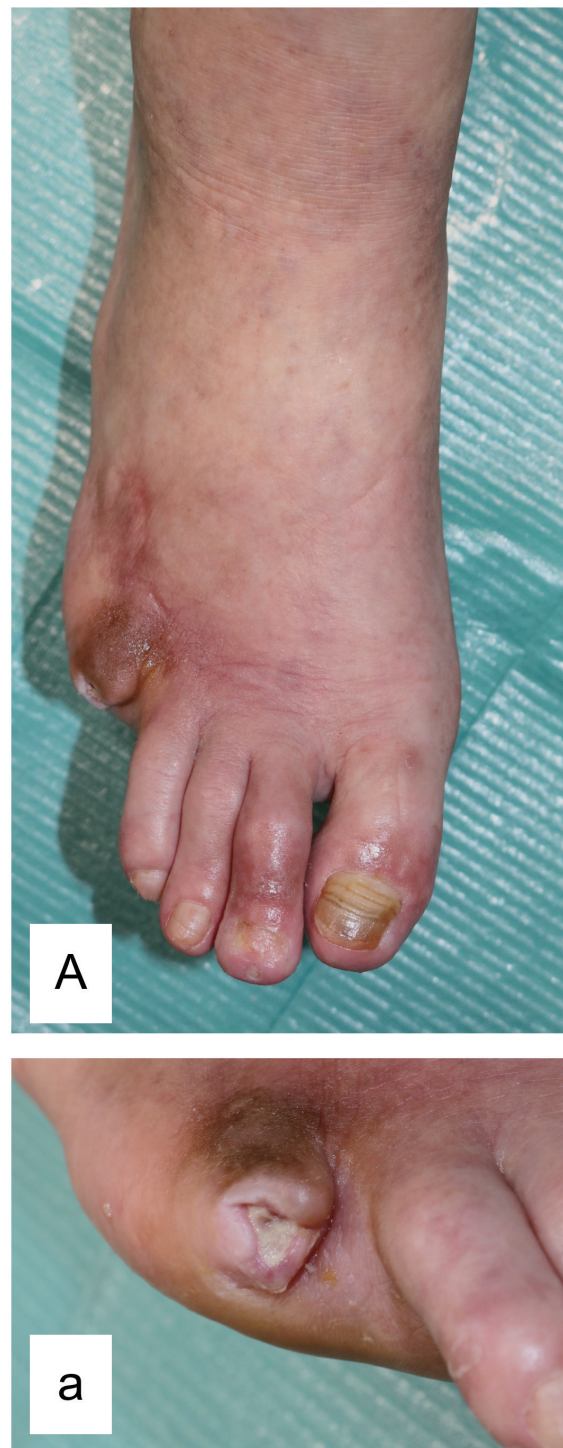
Fig. 1. The right foot ulcer prior to spinal cord stimulation.

The SCS trial was performed under local anesthesia. Since decreased microcirculation was observed in both lower limbs, we planned to introduce two electrodes into the epidural space where paresthesia could be induced in both lower limbs. Bilateral spinal cord stimulator leads (Vectoris Sure Scan MRI compact; Medtronic, Minneapolis, MN, USA) were placed in the posterior epidural space at the T10/11 level where the paresthesia of both lower limbs could be confirmed by intraoperative stimulation (Fig. 3). During the trial, the patient noticed a marked improvement in pain and an improvement in the color and temperature of both lower limbs. Therefore, an implantable pulse generator (IPG, Intellis; Medtronic) was placed 1 week after the