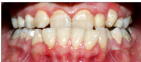
Figure 3. Own case – permanent dentition of AGS.

nasopharynx, the tongue, and the mandible [7,8]. Humphreys et al. [9] reported that JAGGED1 mutations cause the midfacial hypoplasia phenotype observed in Alagille syndrome patients. Cephalometric evaluation shows a decreased mandibular ramus and a wide gonion. Macrocephaly and craniosynostosis are rarely found [6,17,23].