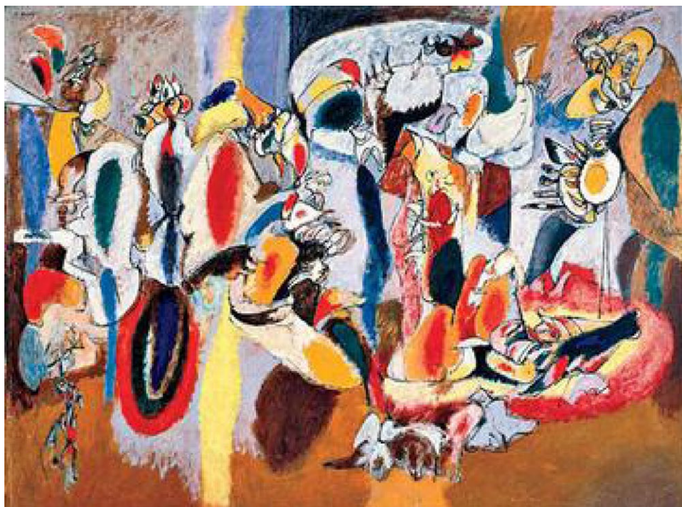
FIG. 4. “The Liver is the Cock’s Comb” (1944) by Arshile Gorky, Albright-Knox Art Gallery, Buffalo, New York.