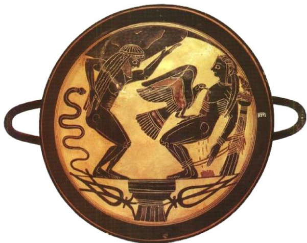
FIG. 1. Atlas holding up the sky and Prometheus bound with an eagle picking out his liver, c. 555 BC, Arkesilas Painter, (fl.c. 565-555 BC), Vatican Museums and Galleries, Vatican City.

Nevertheless, the concept of liver as the seat of life also occurred several times in the epic poem "Iliad," traditionally attributed to Homer. The Greek poet described several war wounds in striking details; it comes as no surprise that all liver injuries he described were fatal. For instance, the Greek hero Achilles slit open Tro's liver "that spurted loose, gushing with dark blood [...] and his life breath slipped away" (Iliad, XX, 530-533). Moreover, in the same poem, Hecuba, queen of Troy, declared that in revenge for the murder of her son