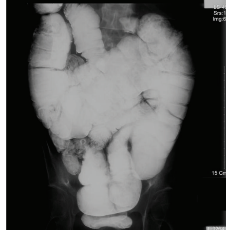
FIGURE 2: Low gastrointestinal series shows the thick and long colon and the abdomen full of the colon.

formulas diet (continue feeding 1200 kcal/day for 5 days). The patient has tolerated oral soft diet and supplement 40 days later. We gave him home PN as regular recommendation and loperamide after being discharged from hospital.