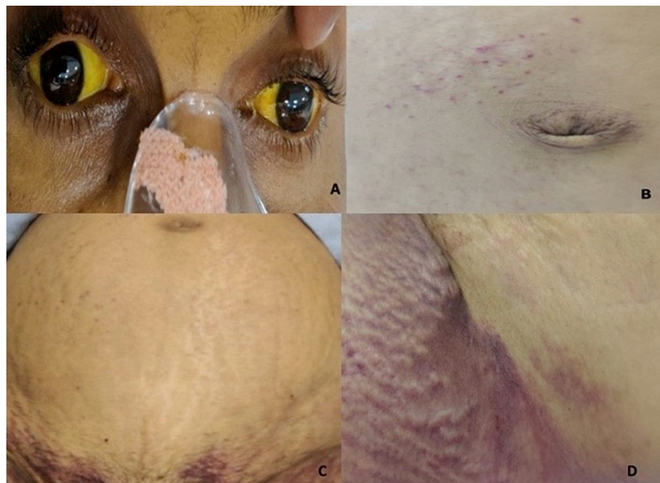
FIGURE 1: (A) Yellowish discoloration of the sclera. (B) Petechial hemorrhages over the supra-umbilical area. (C) Large petechial patch over the lower abdomen and bilateral thighs. (D) Petechial patch over the lateral aspect of the thigh.

Lochia was healthy with reddish discoloration and without foul smell. Her laboratory investigations showed thrombocytopenia, raised international normalized ratio (2.11) along with increased liver enzymes, and a raised conjugated bilirubin, as shown in Table 1. The non-structural antigen for dengue fever was positive. Ultrasonography of the abdomen was performed, which showed 12.1 x 9.6 x 7.8 cm uterus suggestive of post-partum bulky changes, mild splenomegaly (12.5cm), features of acute hepatitis, and gross ascites. The patient was immediately admitted to the intensive care unit and was given intravenous fluids. In view of persistent hypotension, she was started on inotropic support. The patient was transfused a total of 10 random donor platelets and five fresh frozen plasma. The patient was managed with intravenous fluids to maintain hydration, antibiotics, injectable vitamin K, and supportive care, and she gradually improved clinically with an increase of platelet count from 17,000/dL on admission to 110,000/dL on day 6 of admission. She was finally discharged in a stable condition on day 10 of admission and is presently doing well on follow-up.