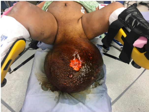
Fig. 1. Presentation of the patient with massive scrotal edema and open wounds over the left hemi-scrotum.