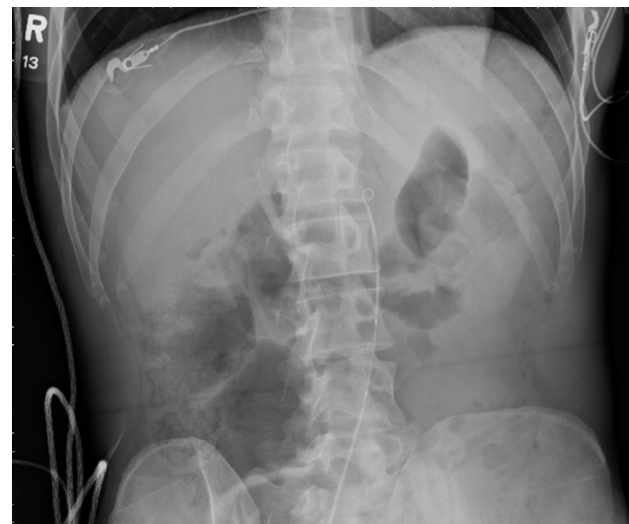
Figure 4 X-ray imaging of Zone 3 REBOA.

Abbreviation: REBOA, resuscitative endovascular balloon occlusion of the aorta.