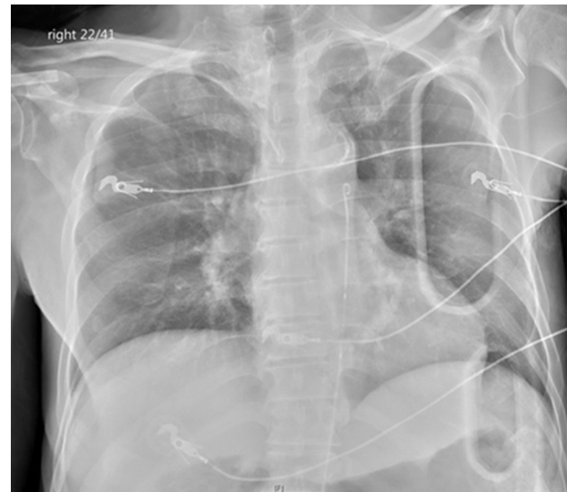
Figure 3 X-ray imaging of Zone 1 REBOA.

based on the clinical algorithm discussed previously. External landmarks are used to estimate appropriate catheter insertion depth. Confirmation of appropriate balloon location via digital X-ray should be performed prior to balloon inflation. At our center, this is done by performing a CXR or pelvic X-ray in the emergency department (ED). The catheter should be seen on the patient's left side adjacent to the spine. Zone 1 is confirmed by visualizing the balloon above the diaphragm (Figure 3). Confirmation of the device in Zone 3 is seen on pelvis X-ray as being in the vertical position at approximately the L2 or L3 vertebrae (Figure 4).