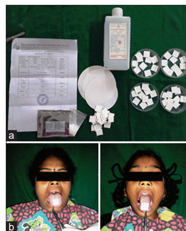
Figure 1: (a) Armamentarium (b) Assessing taste perception

The caries experience of both mother and child were recorded following the WHO criteria. [7] Both primary and permanent dentitions were included and the participants with a total decayed-missing-filled teeth (DMFT)/deft score of >5 were considered as a high caries group.