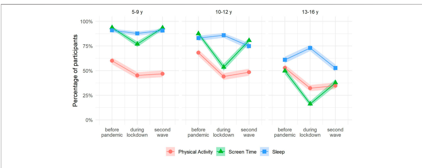
FIGURE 2 Prevalence of participants meeting recommendations for physical activity, screen time and sleep duration by age group (Corona Immunitas, Switzerland, 2020–2021). Abbreviations: PA, physical activity; sleep, sleep duration; ST, screen time; y, years. Time points: before pandemic: before March 2020; during lockdown: between 16 March and 10 May 2020; second wave: between October 2020 and January 2021. Shaded area represents 95% confidence intervals. We classified participants as meeting recommendations according to international guidelines: \geq 1 h/day of PA, \leq 2 h/day of ST, and the recommended range by age-groups for sleep duration (i.e., 10–13 h/nigh of sleep for age 5 years, 9–11 h/night for ages 6–13 years, 8–10 h/night for ages 14–16 years).