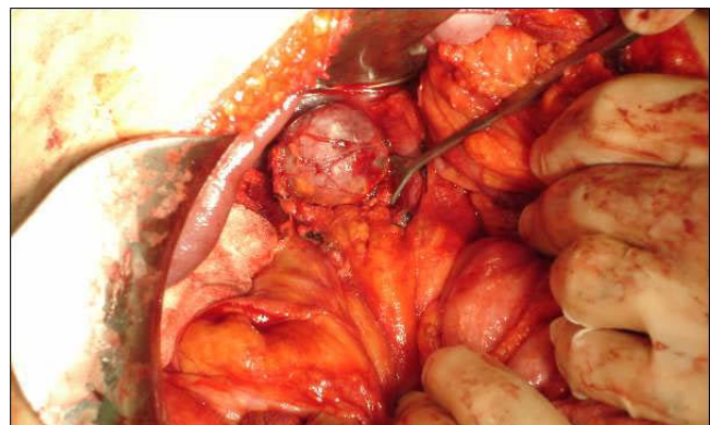
Figure 2 Mass in intraoperative view.

Adenomas frequently contain sufficient intracytoplasmic fat to produce lower attenuation values. With an increasing proportion of lipid mass, the density will be lower. Although the lipid proportion is high in benign cases, it is lower in malignant ones. No adrenal malignancy with a density of 0 HU has been reported in the literature. It is suggested that 4–20 HU density cases must be suspicious