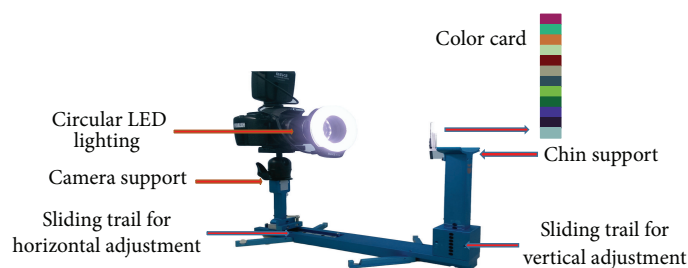
FIGURE 1: Illustration of tongue image capturing with the ATDS.