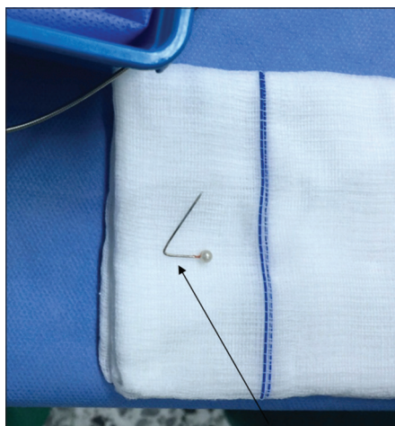
Figure 3: Sharp pin was bent to remove it endoscopically

age, food habits, and even clothing habits, but there is a common classification of organic and inorganic