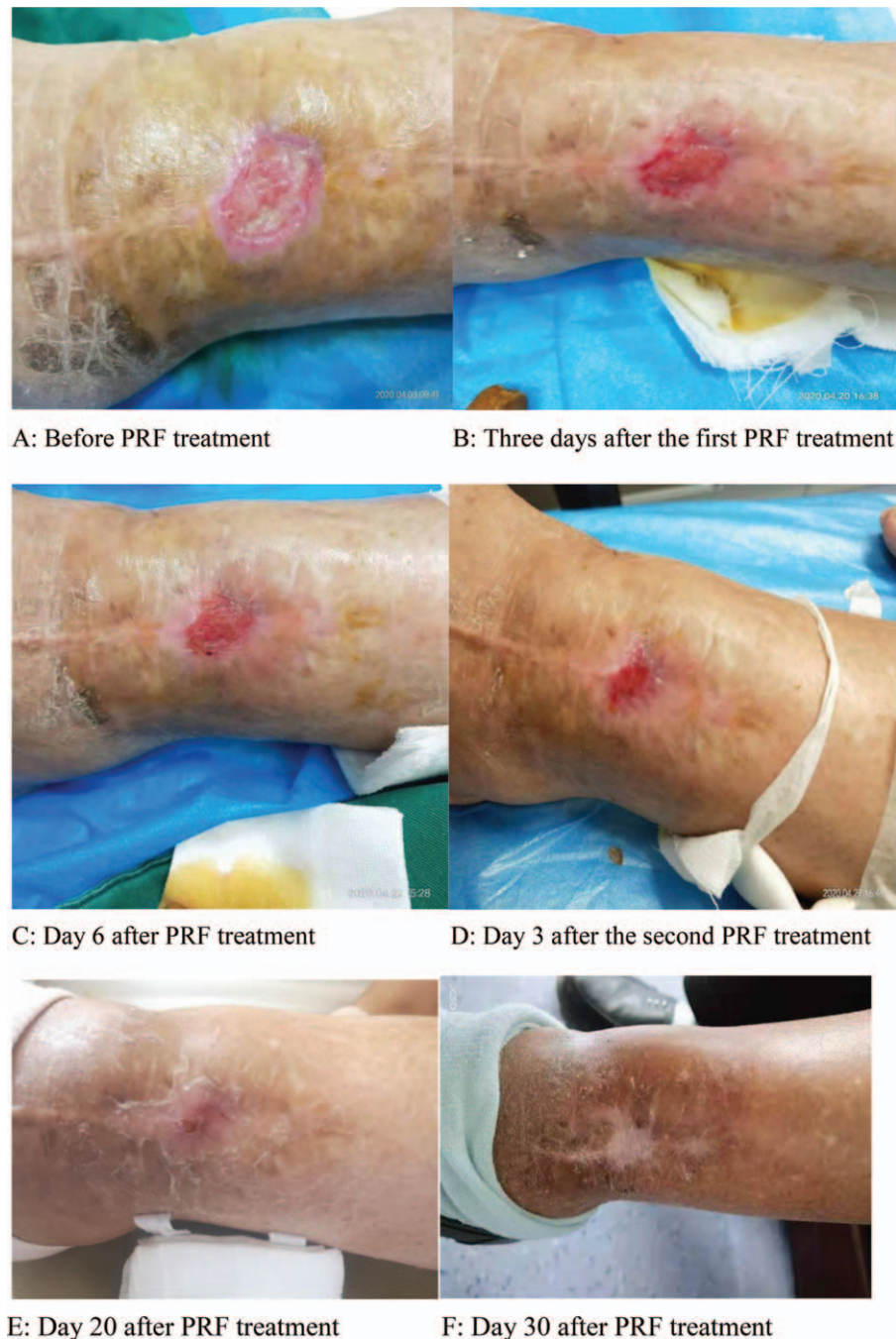
Figure 3. Comparison of the patient's effect before and after treatment of the skin lesion on the anterior margin of the left tibia.