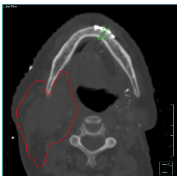
Figure 2 Post-operative treatment distribution with mandibulotomy site visualized.

For the secondary analysis, mixed model regression analysis was used to compare the interdental distances between the different teeth. All P-values were 2-sided and for the statistical analyses, p < 0.05 was considered to indicate a significantly different result and for multiple testing adjustment was made following the method of Benjamini, Hochberg and Yekutieli to control the false discovery rate [11,12]. Data analysis was performed using Statistical Analysis Software (SAS) Version 9.2.