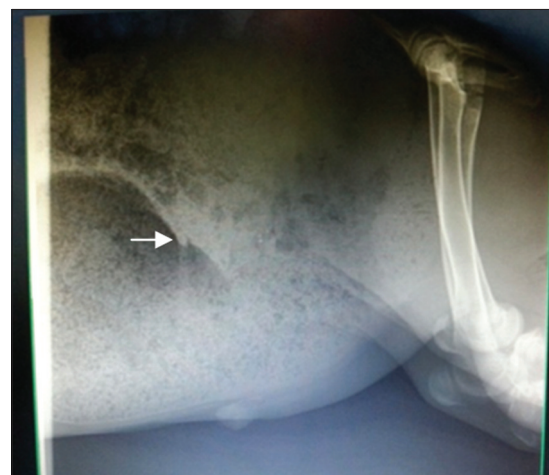
Fig. 4. Radiograph showing right lateral view of the abdomen. Note opaque distended urethra due to obstruction (arrow).