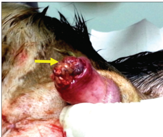
Fig. 6. Urethral process amputation (arrow).