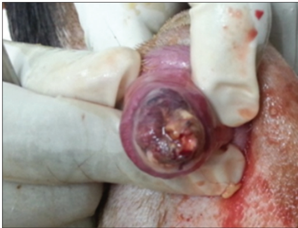
Fig. 1. Inflamed and necrotic penis and prepuce.

Management of obstructive urolithiasis generally involves establishing a patent urethra (Ewoldt et al. , 2008). Thus, urethral process amputation and retrograde urohydropulsion were indicated in this case. The penis was grossly inflamed with presence of multifocal necrotic patches on the preputial surface. The goat was placed in a squatting position and the hair around the prepuce area was shaved and disinfected