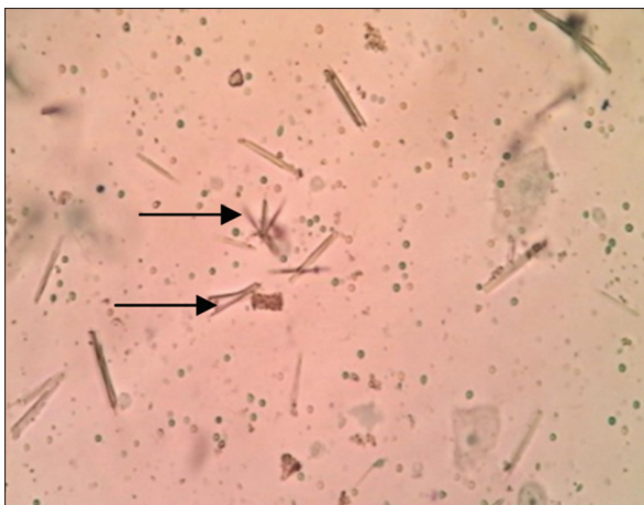
Fig. 2. Calcium phosphate crystals from urine smear (arrows).