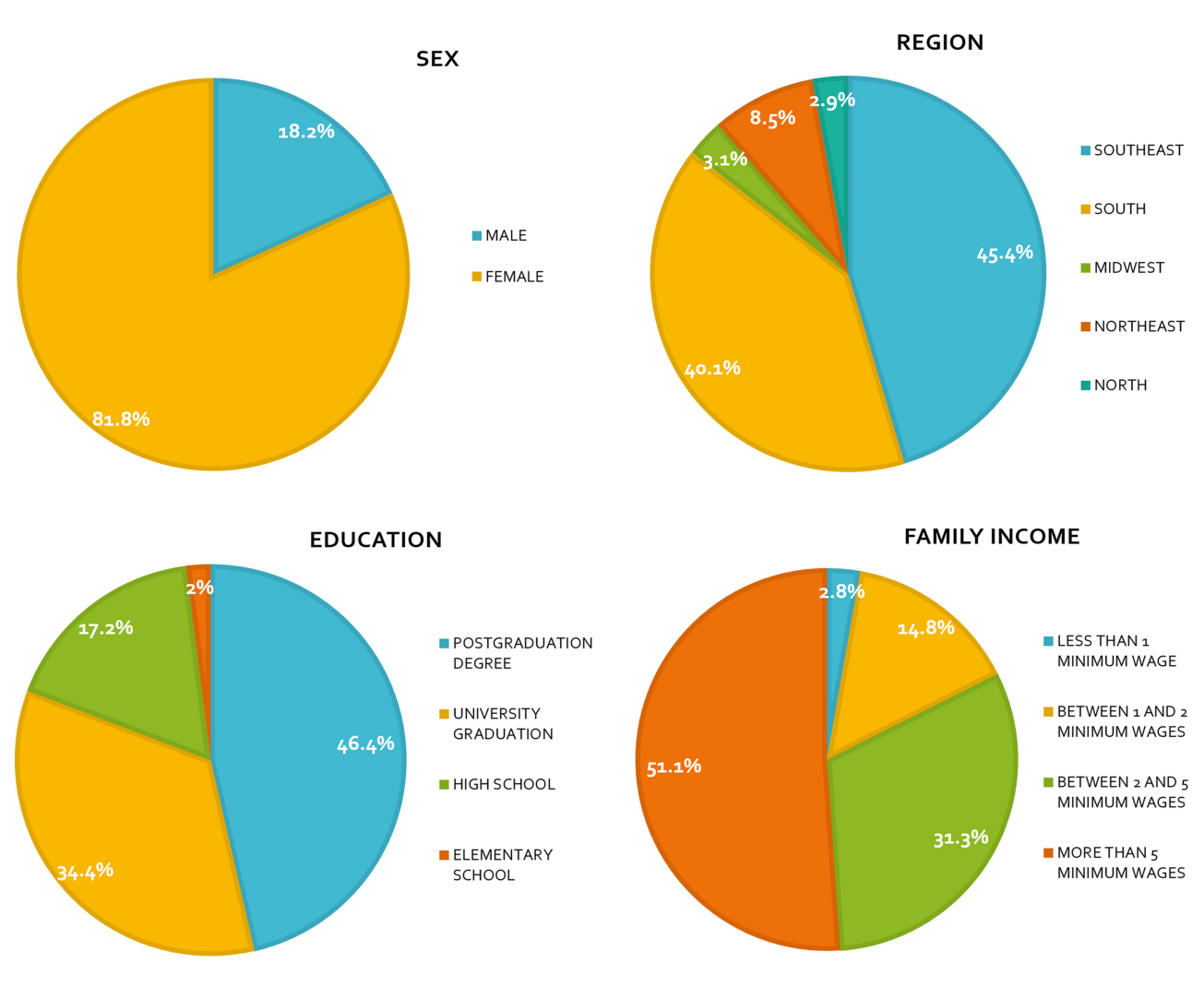
Figure 2 Demographics and sample characteristics.

sequence were observed, one was excluded. The answers and data obtained were stored by the researchers and used only for this study.