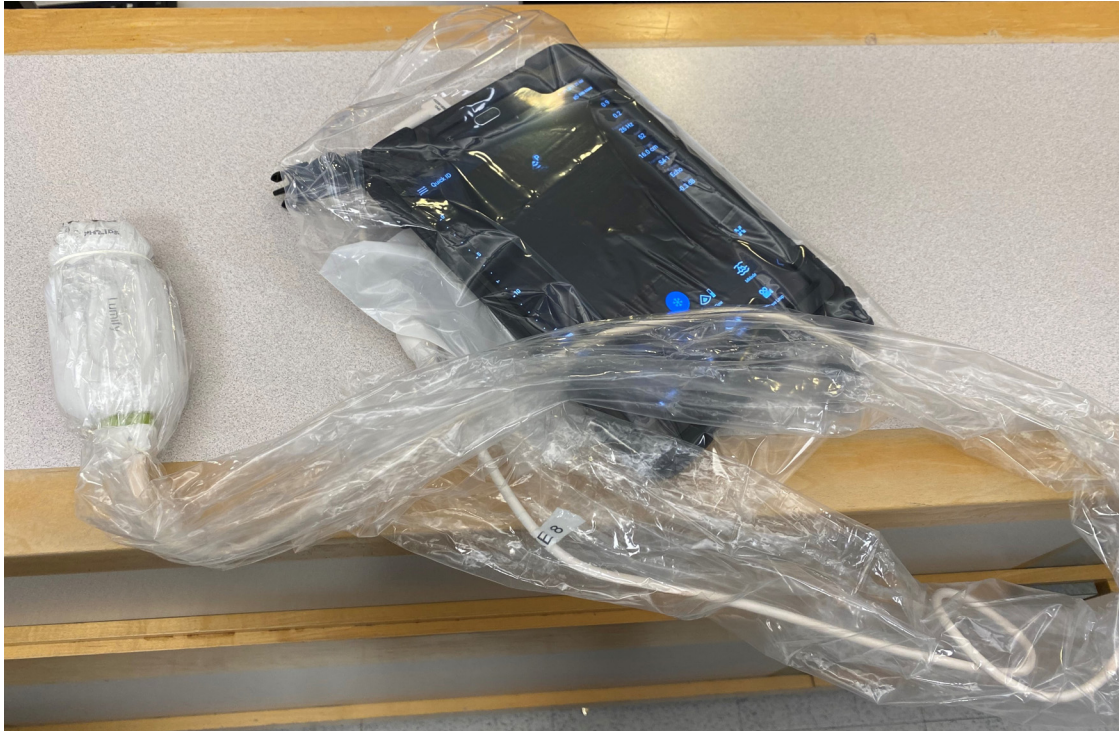
Fig 2. Portable ultrasound used for COVID-19 extracorporeal membrane oxygenation cannulation.