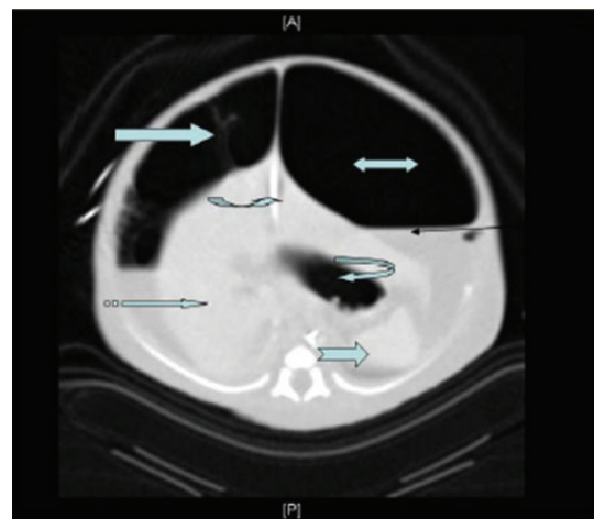
FIGURE 3: Abdominal CT scan image: showing abundant intraperitoneal space (biheaded block arrow) and fluid levels (black line arrow) with multiple thick septation (right block arrow) noted mainly at the right hypochondrium. Umbilical vein catheter (curved right arrow), spleen (notched right block arrow), stomach (curved left arrow), and liver (striped right block arrow) were noted.

distended abdomen is difficult and risky. Such risk would be minimized by fetal paracentesis and CS would not be necessary in most cases [11].