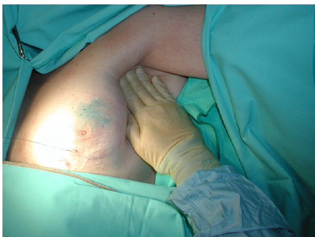
Figure 1 First stage of axillary lymphatic massage.

Four patients (1.2%) developed allergic reaction to patent blue dye which manifested in the form of blisters or wheal and blue hives with bluish discoloration of the skin. One of these patients became hypotensive. All reactions occurred within 45 minutes of the injection and were