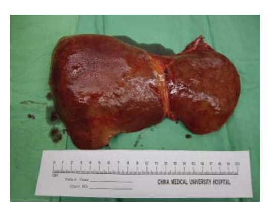
Figure 1. The explanted liver was shrunken, measuring 17.5 x 13.0 x 6.0 cm in size and 520 gm in weight.

general itching and tea-colored urine. On admission, physical examination revealed that her consciousness was clear. Her vital signs were as the follows: body temperature, 36.3 °C, blood pressure, 118/82 mmHg, pulse rate, 79 beats per minutes, and respiration rate, 18 breaths per minutes. Her conjunctivae were pink, and her sclerae were icteric. The results of her heart and chest examinations were normal. Her abdomen was distended with mild tenderness. There was no palpable liver or spleen. Her limbs did not show pitting edema. Laboratory test results were as the follows: serum total bilirubin, 17.4 mg/dL (reference range, 0.2-1.3), with 60% fraction of direct bilirubin; alanine aminotransferase (ALT), 1031 IU/L (0-40); aspartate aminotransferase (AST), 1261 IU/L (0-35); alkaline phosphatase, 168 IU/L (38-126); γ-glutamyltransferase, 118 IU/L (8-50); lactate dehydrogenase, 227 IU/L (98-192); albumin, 3.1 g/dL (3.5-4.9); globulin, 3.8 g/dL (2.5-3.5); and prothrombin time, 24.2 seconds with an international normalized ratio (INR) of 2.12. Serum protein electrophoresis revealed increased level of polyclonal γ-globulin (2.5 g/dL; reference range: 0.7-1.3). Serological examintions were negative for viral and metabolic