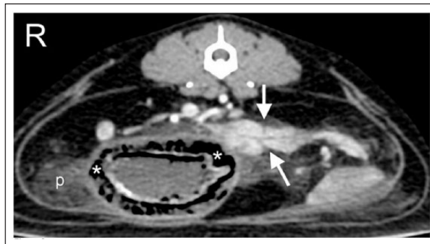
Figure 2 Abdominal CT. There are a few linear hypodense lines crossing the pancreas (arrows) and a small amount of peritoneal fluid (p). The asterisks represent gas within the gastric wall, within the submucosa

CT of the thorax and abdomen was performed. The thoracic images were considered normal. The abdominal images showed a small amount of peritoneal fluid and a few small gas bubbles within the peritoneum located