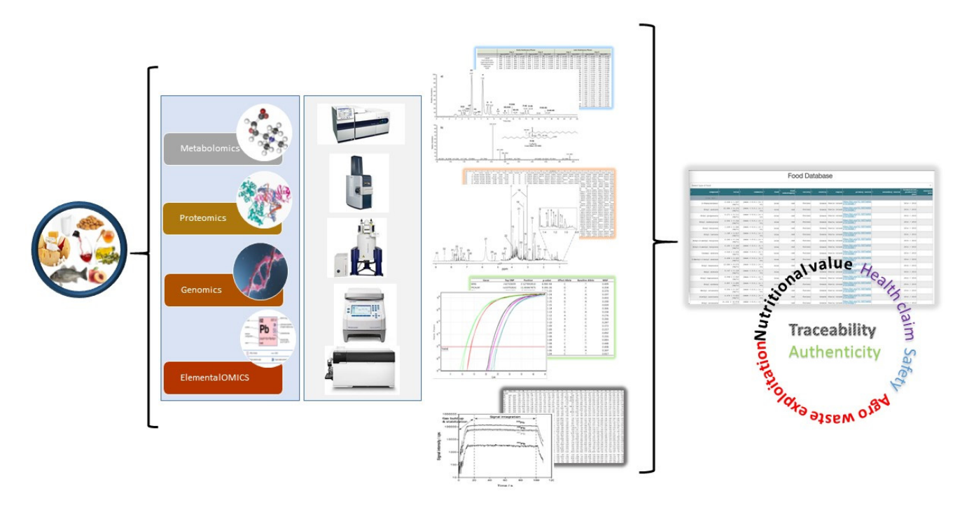
Figure 2. Illustration of the sample path. FoodOmicsGR_RI focuses on the multi-omics analysis of samples by an array of modes in four omics fields (genomics, proteomics, metabolomics and elemental metabolomics) and the fusion and combination of the data to create a comprehensive atlas of the food content for selected Greek foods.