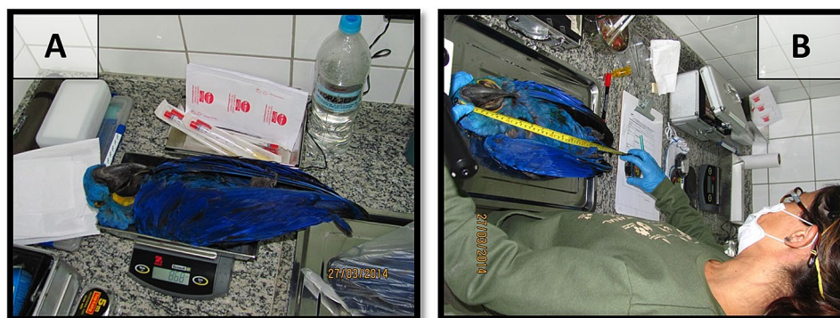
Figure 1. In (A) the individual marked 2014-02 being weighted and in (B) individual 2014-03.