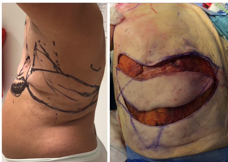
Figure 1 Muscle sparing latissimus dorsi flap with cranial boomerang shape designed to reduce lateral bulk.

procedures. Fat transplantation frequently requires repeated procedures in order to obtain or maintain sufficient volume (7). Implants can be used for augmentation, however, one has as much control over an implant as a housecat and they are equally as reliable, with plans on their own. The boomerang design enables the surgeon to fold the flap in the shape of an implant to create projection and fill both the upper and lower pole as opposed to the traditional flap, which mainly covers the inferior, and lateral half of the breast most often leaving the upper pole empty. The boomerang design may potentially provide patients with an alternative for autologous breast reconstruction without the addition of an implant, which is often necessary to obtain sufficient volume for reconstruction, when using the traditional LD techniques.