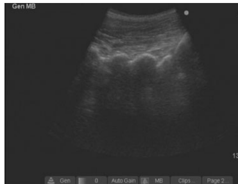
Fig. 1 A long-axis view of the articular processes (AP), about 2-cm lateral to the median. A hyperechoic area in the sacral foramina (SF) is observed