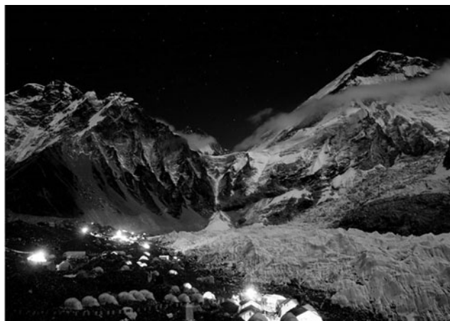
FIG. 1. Study site of the field study, EBC. EBC, Everest Base Camp.

The following data were collected as self-ratings: socio-demographic data, data on lifestyle habits and past medical history, data related to the altitude climb, including data