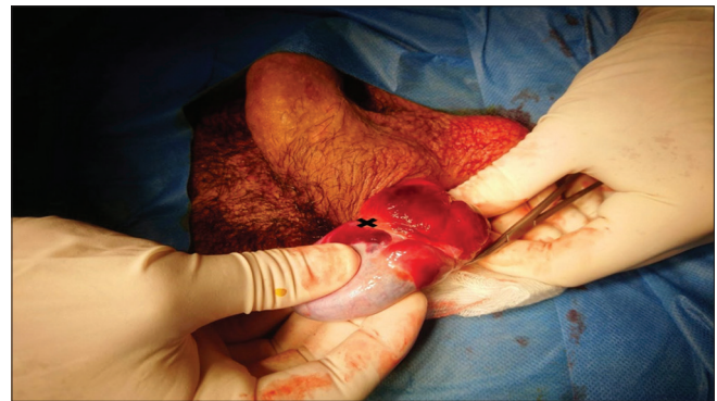
Figure 4: Spermatic cord's perfusion has been improved after the moist warm swabs. The haematoma of the epididymis is also noted (x)

intact [Figure 2]. The child was admitted to the Pediatric Surgery Department for follow-up where he was given analgesic and antibiotic treatment. After 6 h of his admission to the clinic, the swelling and the pain worsened and the repeated ultrasound examination confirmed the increase in the diameter of the haematoma. During the ultrasound examination, the radiologist raised the suspicion of possible twisting of the spermatic cord without being absolutely sure because of the existing oedema. The child was taken to the operating room for urgent exploration. A large haematoma of the upper pole of the testis was found and the spermatic cord to be 'strained' due to 180° clockwise rotation and the associated oedema. The testicle was intact without signs of injury or ischaemia [Figure 3]. The swollen spermatic cord was placed in the appropriate direction and wrapped in moist warm swabs and its colour observed intermittently. Five minutes later, its perfusion had been improved and after careful inspection of the area, a haematoma of the spermatic cord and minor bleeding due to partial epididymal rupture were observed [Figure 4]. Haemostasis was achieved by placement on the bleeding epididymal surface a piece of fibrillar surgical. Subsequently, a 'window' orchidopexy of this testicle was performed. Post-operative period was