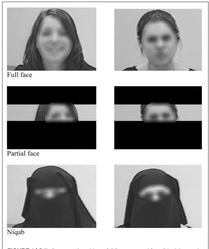
FIGURE 1 | Stills from emotion videos, full face, covered face (black bar and niqab).

In short, after watching a neutral video, participants watched three different, muted, videos of a woman displaying happiness, anger and shame while telling a story. The women were either shown without niqab (full face), with niqab, or with their face partly covered by black bars.