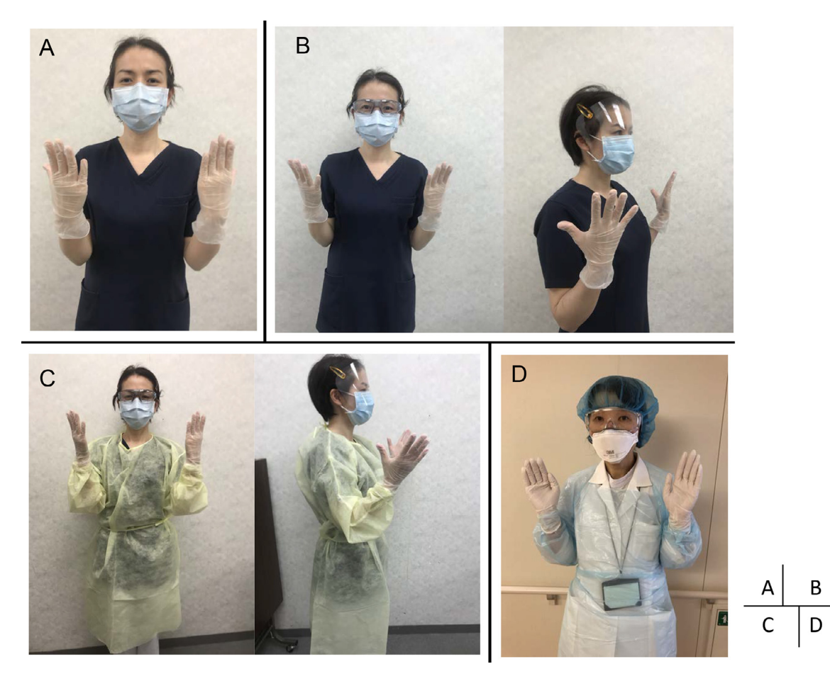
Fig. 1. (A) sPPE (standard PPE): PPE based on standard precautions. "Surgical masks, gloves" (B) E-PPE (Eye-PPE): PPE in which eye protection (E) is added to sPPE. "Surgical mask, gloves, face shields, or goggles" (C) EB-PPE (Eye/Body-PPE): PPE in which eye protection (E) and body protection (B) are added to sPPE. "Surgical masks, gloves, face shields or goggles, and gown or apron" (clean exposed skin of the upper extremities after using the apron). (D) full-PPE: Preventive measures against aerosol infections.