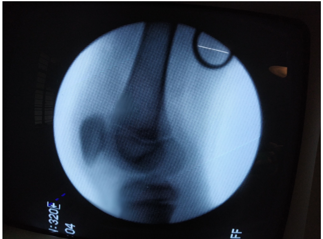
FIGURE 7: On-table immediate post-reduction of the patella visualized on the image intensifier: lateral view