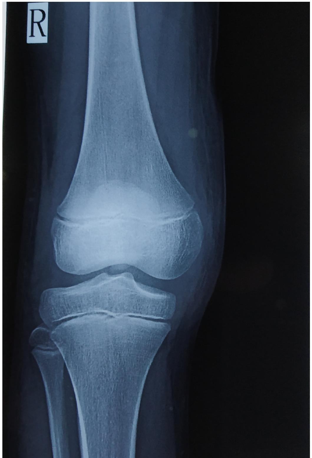
FIGURE 10: Post-operative X-ray of the right knee joint: anteroposterior view