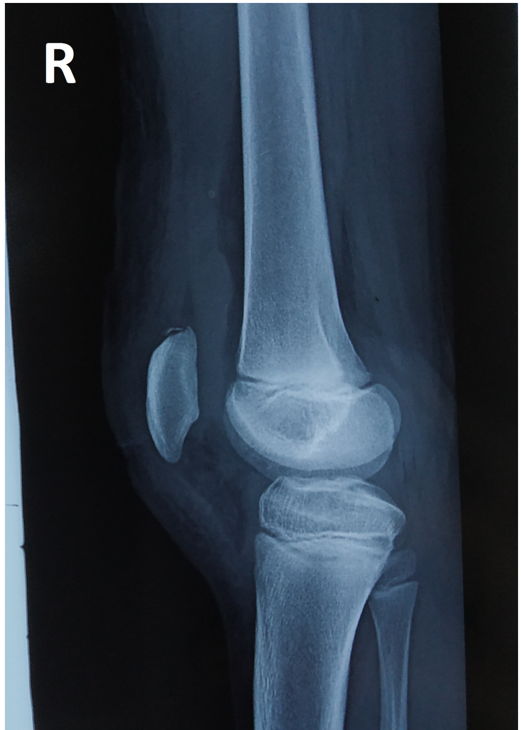
FIGURE 11: Post-operative X-ray of the right knee joint: lateral view