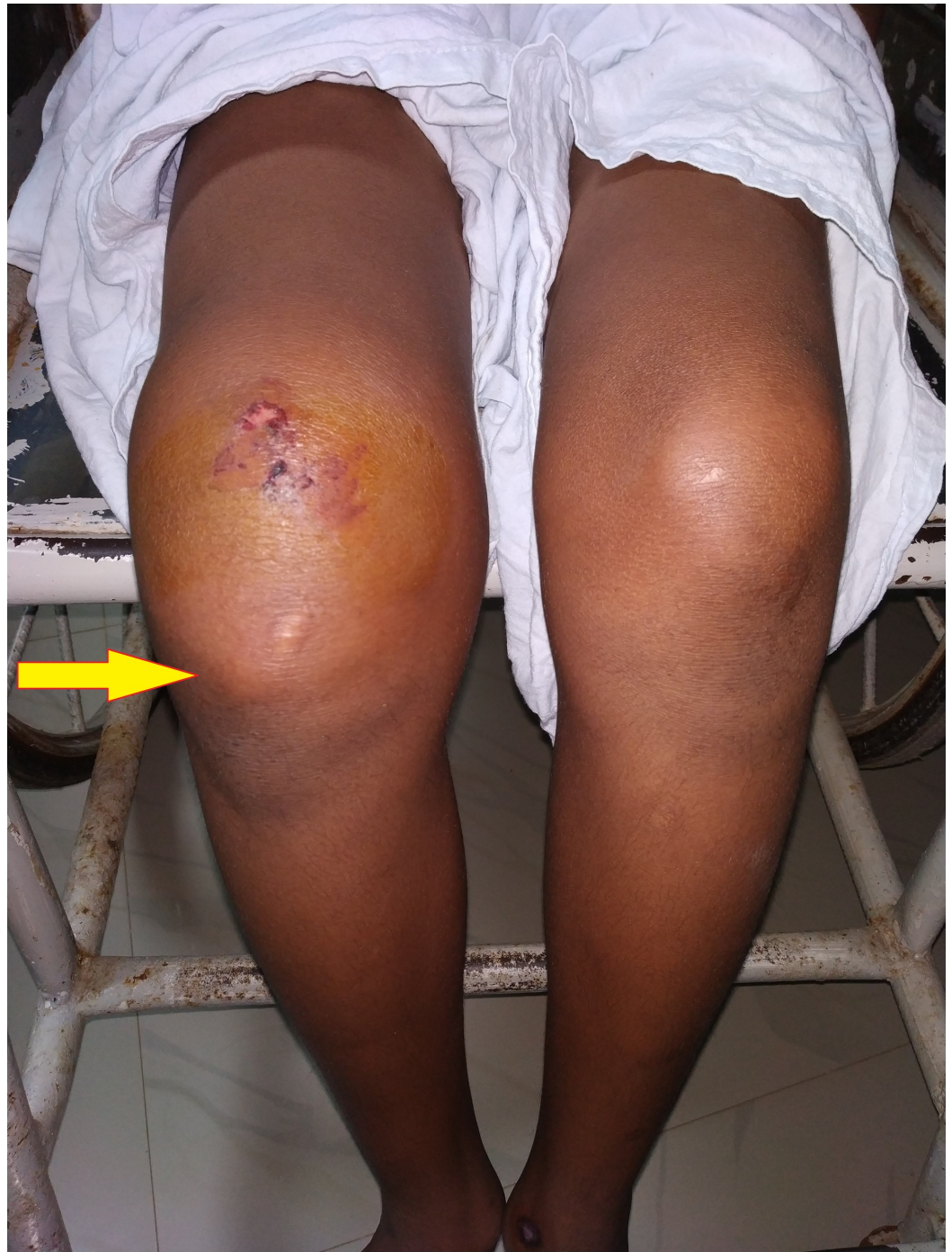
FIGURE 1: Presentation of the patient to casualty, swelling present in the right knee joint with prominent inferior pole of patella: anterior view

palpable while the inferior pole was most prominent. The patellar tendon was taut and intact. The patient was comfortable in 85 degrees of flexion in the right knee (Figures 1-2). A further five to 10 degrees passive flexion was possible but was painful. Further tests were not performed due to the discomfort of the patient. The normal range of movements was present at the ipsilateral hip and ankle joint. There were no distal neurovascular deficits.