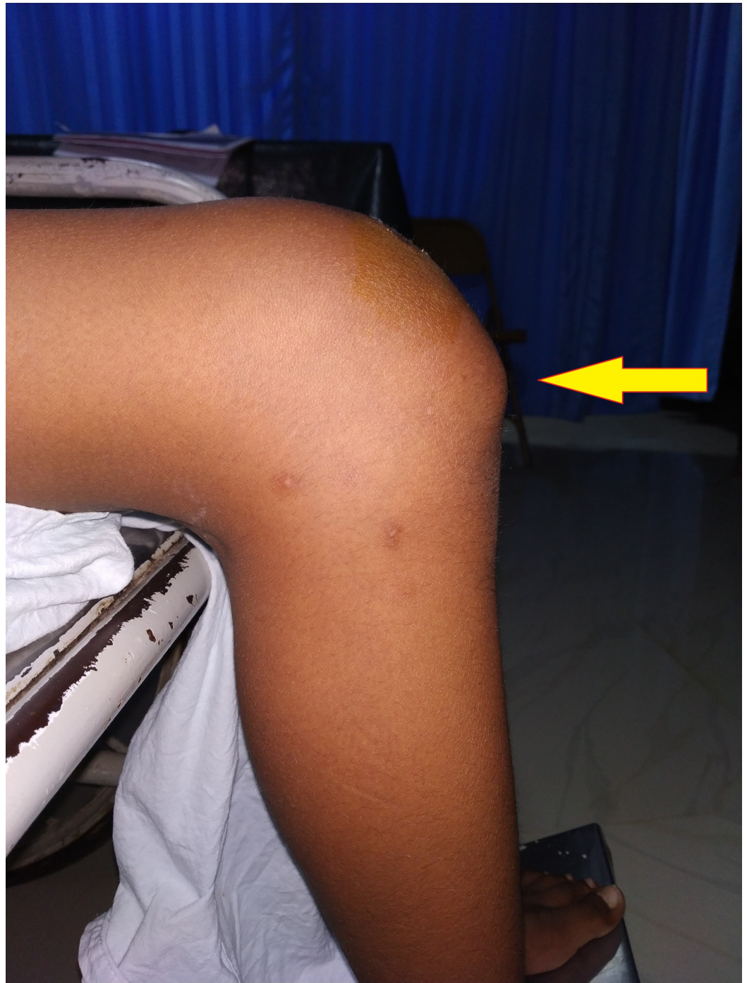
FIGURE 2: Inferior pole of the patella being more prominent: lateral view of the right knee