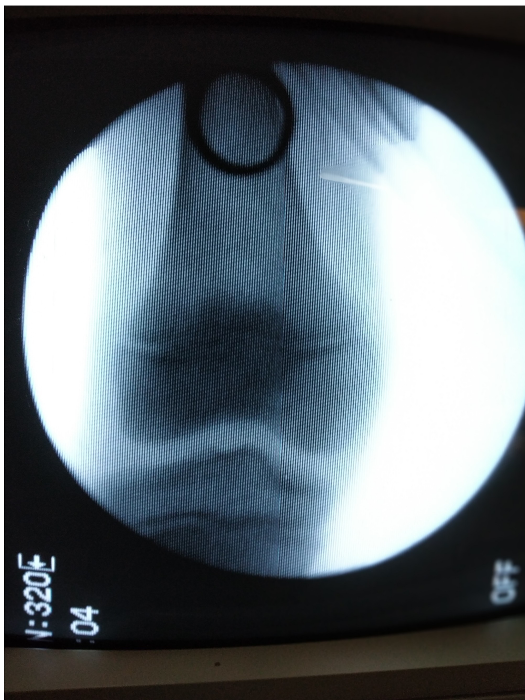
FIGURE 6: On-table immediate post-reduction of the patella visualized on the image intensifier: anteroposterior view

normal without any patellar instability with intact patellar tendon. The reduction was cross-checked in the image intensifier, both in the anteroposterior and lateral views (Figures 6-7).