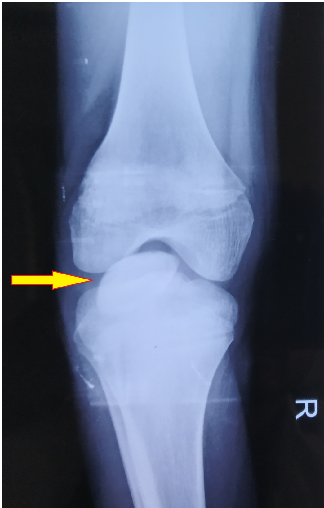
FIGURE 3: X-ray of the right knee shows intra-articular dislocation of the patella: anteroposterior view