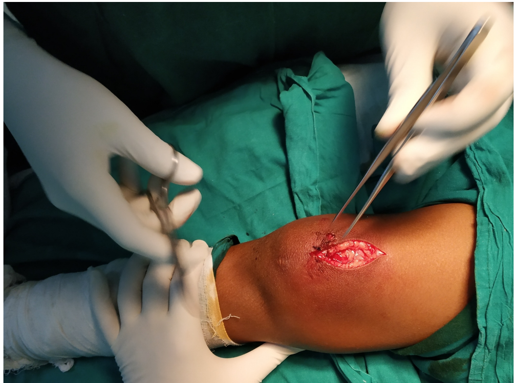
FIGURE 8: A paramedial incision given just above the superior pole of the right patella