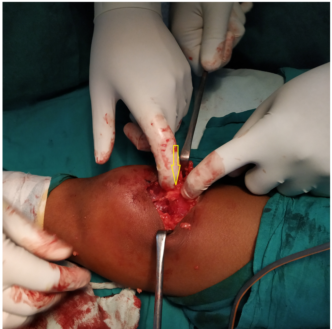
FIGURE 9: Quadriceps tendon tear identified in the superolateral aspect of the right patella

A non-absorbable polyethylene terephthalate suture (Ethibond, Ethicon Inc., New Jersey, United States) was used to repair the tendon tear. An above-knee cylindrical slab was applied in the complete extension of the right knee joint. The postoperative period was uneventful. The patient was allowed partial weight bearing on immediate post-op Day 1. Check X-rays of the right knee in the anteroposterior (AP) and lateral views were taken (Figures 10-11). Skin sutures were removed on the tenth postoperative day; the cylindrical slab was continued for three weeks. Follow-up was done in the first, second, and third months. Active quadriceps exercises of the right knee were started from the first follow-up. On every visit, the range of movements was satisfactory, with no visible deformity.