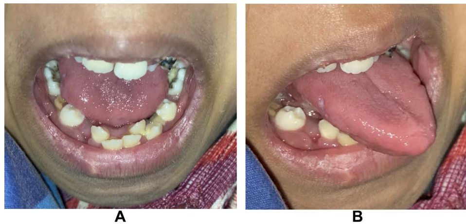
Figure 4 The size of the oral ulcer at the lateral border of the tongue was getting smaller and showed some improvement in the third visit (1-week follow-up).