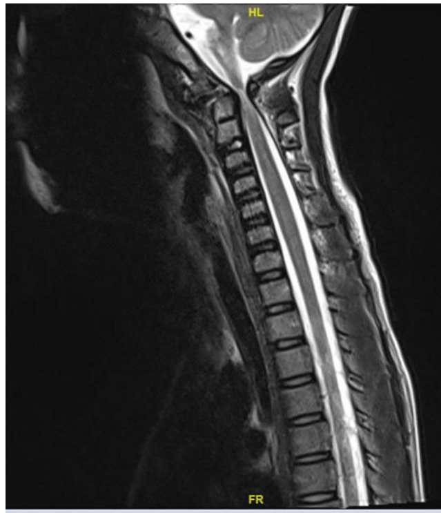
Figure 2 The results of the MRI examination showed a dislocation of the patient's cervical spine.

74, and 85 teeth. The diagnosis of the chronic ulcer was based on clinical examination. There was an indurated margin in the traumatic lesion, which mimicked Oral Squamous Cell Carcinoma clinically. The patient has been hospitalized for 4 days and was given paracetamol 120 mg/5 mL oral suspension and amoxicillin 125 mg/5 mL oral suspension from the Pediatric Department. The patient also was given sodium chloride 0.9% solution, povidone-iodine mouthwash 1%, and petroleum jelly from the Oral Medicine Department. The patient's mother was instructed to clean the patient's oral cavity using gauze soaked in sodium chloride 0.9% solution, compress the ulcer using povidone-iodine mouthwashes 1% three times a day as an antiseptic and anti-inflammatory agent to the oral ulcer, and apply petroleum jelly to moisturize the patient's lips. The patient was also suggested to extract the 55, 62, 74, and 85 teeth.