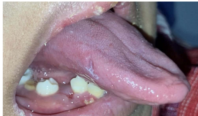
Figure 5 In the fourth visit (10 days follow-up), the size of the oral ulcer at the lateral border of the tongue already had a significant improvement.

In the fourth visit (10 days follow-up), the size of the oral ulcer at the lateral border of the tongue already had significant improvement. Two days after the fourth visit, the patient underwent neurosurgery. The patient was observed in the Pediatric Intensive Care Unit postoperatively. After two weeks of observation in the Pediatric Intensive Care Unit, the experienced respiratory failure and was declared dead [Figure 5].