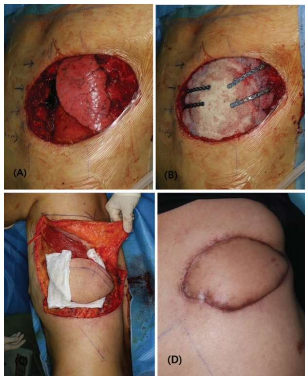
Fig. 1 Case 1. (A) Anterolateral chest wall defect including second to fifth rib resection. Exposed lung and pericardium. (B) Skeletal reconstruction with bone cement, titanium plate, and Marlex mesh. (C) Soft tissue reconstruction with pedicled latissimus myocutaneous flap. (D) Final result after partial necrosis due to surgical site infection.

The process of skeletal reconstruction method as an algorithm was presented based on our experiences. For soft tissue defect, considering rotation arc and defect size, local flap was first choice if possible. If rotation arc was not available or defect size was too large to perform local flap, free flap was selected with appropriate donor. For stabilization of skeletal structure, metal plates and screws and artificial material were used for skeletal reconstruction (►Figs. 1, 2) (►Table 3). The location of defect is as follows: five middle lateral defect, four median defect, two posterolateral defect, one upper lateral defect, and one inferolateral defect. Appropriate flap selection according to the defect size and location was conducted (►Table 4). In soft tissue reconstruction, there were eight latissimus dorsi musculocutaneous (LDMC) rotation flap (►Fig. 1), two pectoralis major musculocutaneous (PMMC) flap, two vertical rectus abdominis musculocutaneous (VRAM) free flap (►Fig. 2), and one LDMC free flap. All flaps survived. Two patients had partial necrosis of the flap treated with debridement