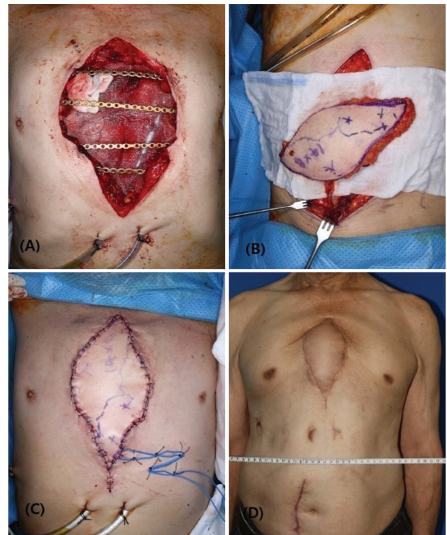
Fig. 2 Case 2. (A) Midline chest wall defect including third to sixth rib resection and total sternum. Exposed lung and pericardium. (B) Skeletal reconstruction with titanium plate, screw, and Prolene mesh. (C) Soft tissue reconstruction with free vertical rectus abdominis myocutaneous flap. (D) Final result.

and secondary wound healing. There were six postoperative pulmonary complications: four temporary atelectasis, one pneumonia, and one acute respiratory distress syndrome treated with conservative pulmonary care and antibiotics. Three patients had postoperative chemotherapy and five patients had postoperative radiotherapy. Two patients complained temporary limitation of shoulder mobilization after radiotherapy. The mean follow-up period was 11.52 months (range, 6–30 months).