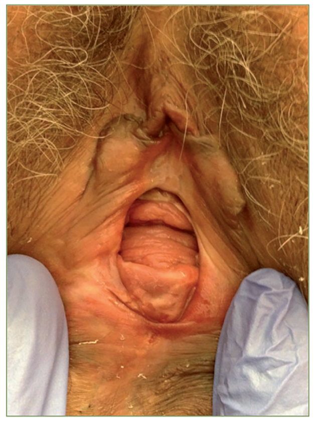
Figure 4 - Case 2: Vulvar and vaginal aspects prior to treatment.

vaginal mucosa was normal. Vaginal wet mount was normal, except for a moderate inflammation. Analytically, thyroid function was normal.