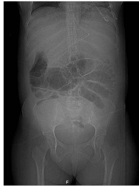
Fig. 2. Abdominal X-ray showing distension of gastric chamber and initial portion of small bowel, with no signs of pneumoperitoneum.

Hemorrhage, pain and fluid absorption are widely recognized as the most frequent of hysteroscopic complications [1]. Infection occurs less frequently, with reported rates ranging from 0,2–1,5% [2]. This case illustrates the importance of ascending infection even in generally safe procedures. Being alert for and enquiring about known risk factors (smoking, history of PID, endometriosis, multiple partners or recent change in sexual partner) can help reduce the incidence of post-procedure infection. Currently, there is no evidence that antibiotic prophylaxis prior to transcervical procedures reduces infection rates [3]. Although vaginal disinfection is also not mandatory, it can still be