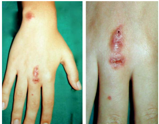
FIGURE 2: Ulcerated nodular lesions. Lesions at first dermatological appointment

necrosis, suggestive of granulomatous disease. It is known that tetracyclines are an alternative therapy for mycobacteriosis. We chose to start treatment with one drug of this class, lymecycline 150mg/orally/day, due to history of gastritis triggered by previous antibiotic treatments, since this drug is better tolerated. After 10 days of treatment, she had clear signs of lesion improvement and we chose to keep the treatment and reevaluate after 45 days (Figure 3). After this period, the patient returned to the clinic with total remission of lesions; we decided then to suspend all medication and discharged the patient, in view of the good development, thereby obtaining a clinical cure.