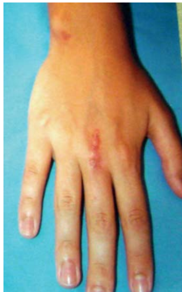
FIGURE 3: Lesion showing evident clinical improvement. After 10 days of treatment with lymecycline 150mg VO/day, important clinical improvement could already be observed