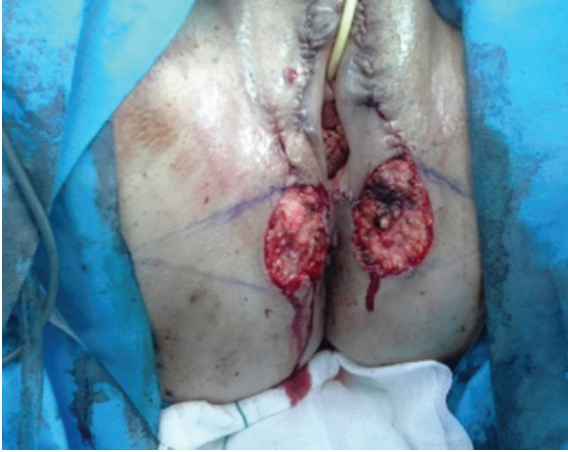
Fig. 2: Patient during the surgical procedure.