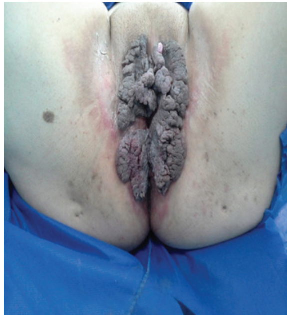
Fig. 1: Patient with giant condyloma prior to reconstructive surgery.

A 50-year-old female presented with cauliflower-like growth over the uvula region. The growth had been diagnosed previously as condyloma acuminatum which was resistant to conservative therapy (Figure 1). The patient was 35-year-old when she first noted the lesion and did not seek any medical help. Two years later she became pregnant and during pregnancy period, she received conservative treatment and lesion disappeared after her delivery. After 2 years during the first trimester of the patient's second pregnancy, warts appeared for the second time with altered clinical presentation; spread across the entire uvula region she underwent cryosurgery, but with no significant improvement