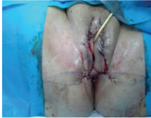
Fig. 3: Patient after surgery.