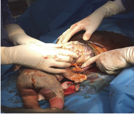
FIGURE 1: Umbilical cord being removed from the fetal neck.