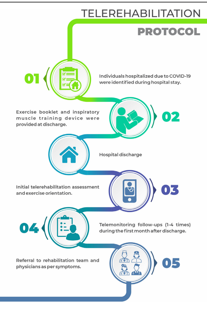
Fig 1 Telerehabilitation protocol for COVID-19.