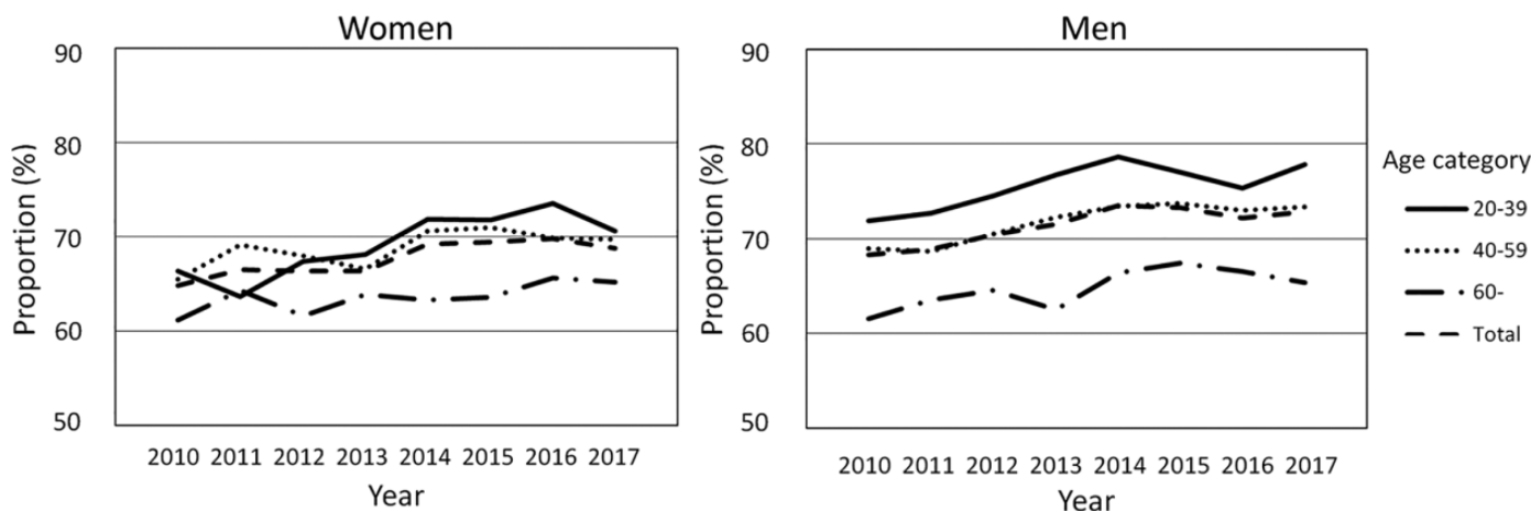
Figure 2. Annual proportion of Achilles tendon rupture treated surgically by sex and age category.