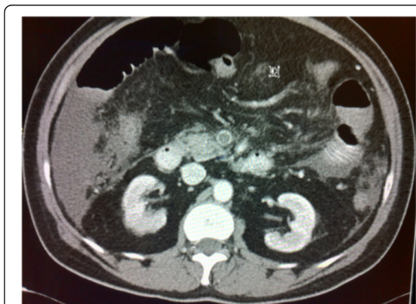
Figure 1 Axial computed tomography scan of the patient's abdomen with contrast enhancement showing portal vein thrombosis causing complete occlusion of the lumen of the portal vein.

Genetic testing for factor V Leiden mutation and JAK2 gene mutation was negative. Immunoglobulin G (IgG) and IgM assays for anti-cardiolipin and anti-β 2 -glycoprotein