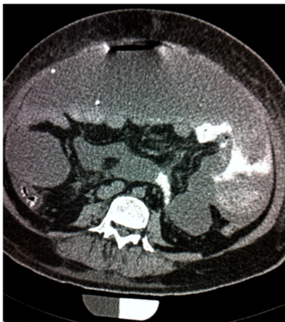
Figure 3 Emergent axial computed tomography scan of the abdomen with contrast enhancement showing extravasation of contrast from the proximal small bowel, indicating bowel perforation.

well as profound jaundice and encephalopathy, indicative of end-stage hepatic failure. Despite aggressive anti-coagulation therapy being administered continuously throughout the patient's admission, and in spite of his vitamin B 12 and homocysteine levels turning normal, his thromboses did not resolve. This resulted in splenic infarction as well as progressive liver failure with severe hepatic encephalopathy. The patient eventually died due to hepatic failure three months into his hospital stay.