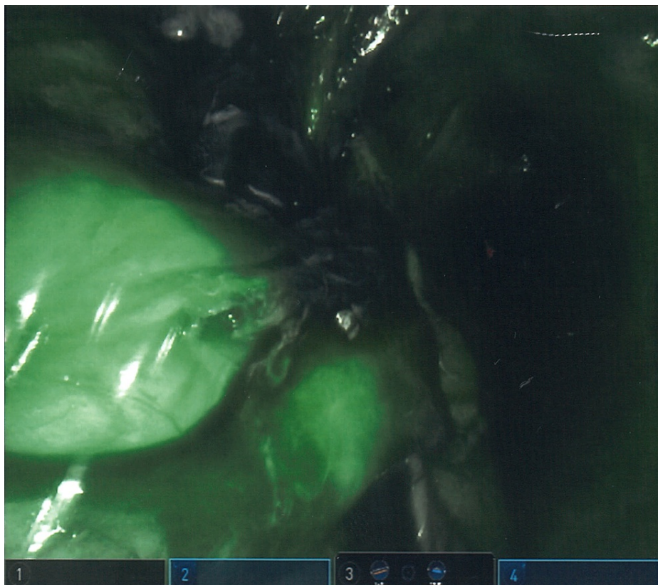
FIGURE 1: Intraoperative photo featuring ICG fluorescence imaging of colorectal anastomosis.

After completing the anastomosis, a 5 mg (2 mL) dose of ICG was administered through the patient's left forearm IV catheter to evaluate perfusion to the anastomosis. However, no fluorescence was visualized. A second 5 mg (2 mL) dose of ICG was then administered via the patient's right forearm IV and revealed robust perfusion to the anastomosis (Figure 1).