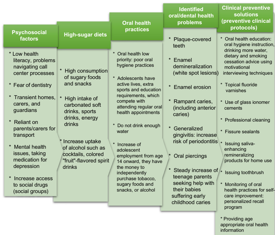
Figure 3 Senior clinicians' perceptions of factors affecting adolescents' oral health issues and potential solutions.

very challenging. Teenage pregnancy and the father of the child, their children developing early childhood dental caries [SC013]