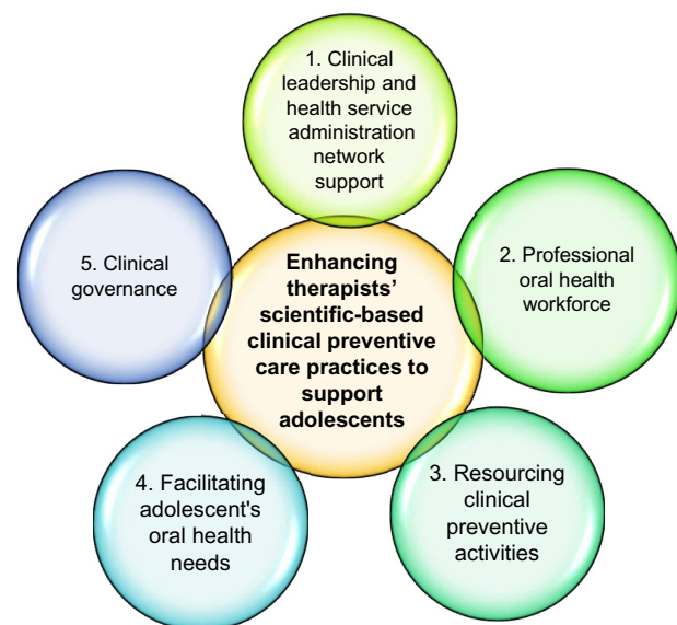
Figure 1 Influencing factors to enhance the provision of clinical preventive care to adolescents accessing NSW Public Oral Health Services. Abbreviation: NSW, New South Wales.

A clear hierarchical clinical leadership structure (Figure 2) within each LHD was reported essential for communication and implementation of NSW Health policies to inform