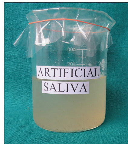
Figure 5: Artificial saliva