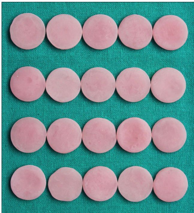
Figure 2: Heat-cured denture base specimens after finishing and polishing

The initial surface roughness values were measured using a pick-up-type piezoelectric profilometer. The profilometer has a diamond stylus with a tracing length of 5–10 mm. The stylus is moved across the specimen surface with 0.8 mm