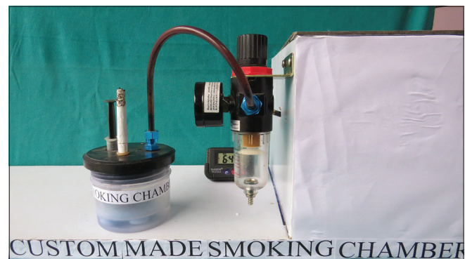
Figure 6: Custom-made smoking machine