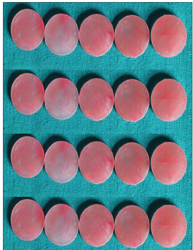
Figure 3: Flexible denture base specimens after finishing and polishing