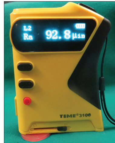
Figure 4: Specimen undergoing surface roughness test