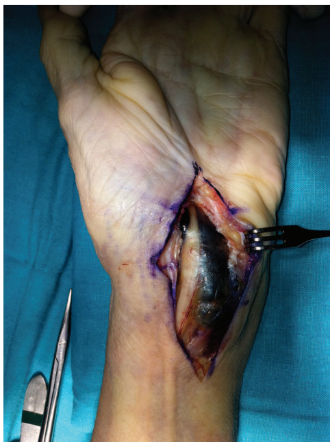
Fig. 2 Clinical picture of a surgical case of carpal tunnel syndrome (CTS) release. A 51-year-old woman with pain and paresthesias of the median nerve territory of her left hand was treated with adequate replacement therapy and surgical release after progressive symptoms. An extensile volar approach was used to adequately explore the extent of the haematoma. After carpal tunnel release, evacuation of the haematoma and neurolysis of the median nerve, the patient recovered swiftly.

test, and will show neurologic impairment of the median nerve. The diagnosis requires careful clinical evaluation, as initial clinical features may be subtle. The investigation of choice for acute CTS is an MRI of the wrist to image the carpal tunnel and to exclude articular pathology. When this investigation is not available, ultrasound scans are useful to image the soft tissue mass combined with radiographs to exclude an acute fracture. Differential diagnosis must be made with fractures, dislocations, and haematoma causing compartment syndrome.