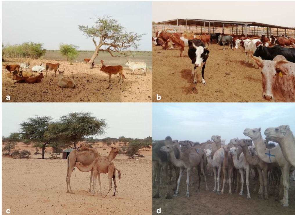
Fig. 3a–d Different habitats of the livestock herds (cattle and camels) selected for sampling. Cattle (a) and camel herds (c) grazing near Rosso (Trarza) close to the Senegal river (southern Sahel). The favorable climatic conditions permit the growth of large trees in the savanna landscape and also the cultivation of crops. In contrast, a modern dairy farm in Idini (b) is completely surrounded by desert. d Camels gathered together for sale at the highly frequented Nouakchott livestock market/slaughterhouse

contact with viremic host blood, or when crushing ticks during their removal from animals, remains, as does the risk posed by questing larval and nymphal stages. Thus, enforcing tick control strategies and encouraging public awareness of tick bite prevention in these areas is recommended. The findings of this study point to the urgent need for large-scale epidemiological studies across Mauritania to achieve a comprehensive risk analysis of exposure to CCHFV in the country.