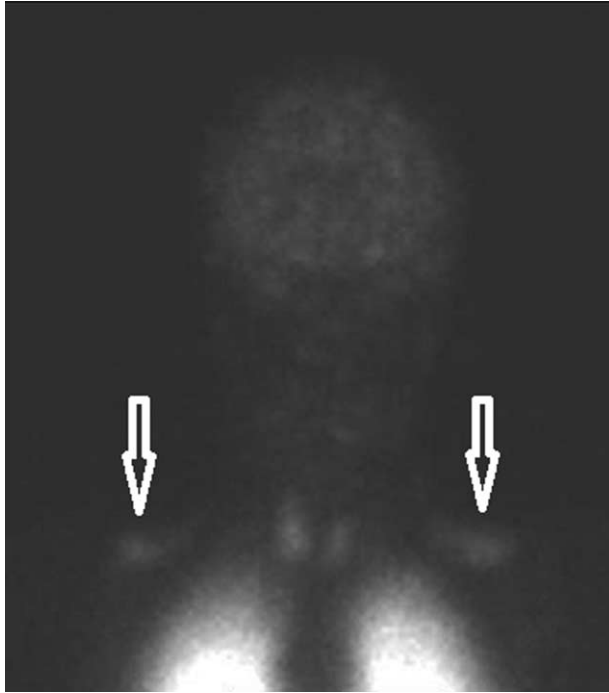
FIGURE 1. This is a perfusion scan using Tc-99 macroaggregated albumin of the head and upper chest showing uptake in the brain, thyroid gland, and bilateral supraclavicular regions (arrows).

BAT uptake in these radiotracers are usually the supraclavicular and paravertebral adipose tissues 13,14 . The available images we have, however, show only Tc-99m MAA accumulation in the supraclavicular adipose tissue with no definite evidence of accumulation in the paravertebral adipose tissues, which if present may be obscured by the lung activity.