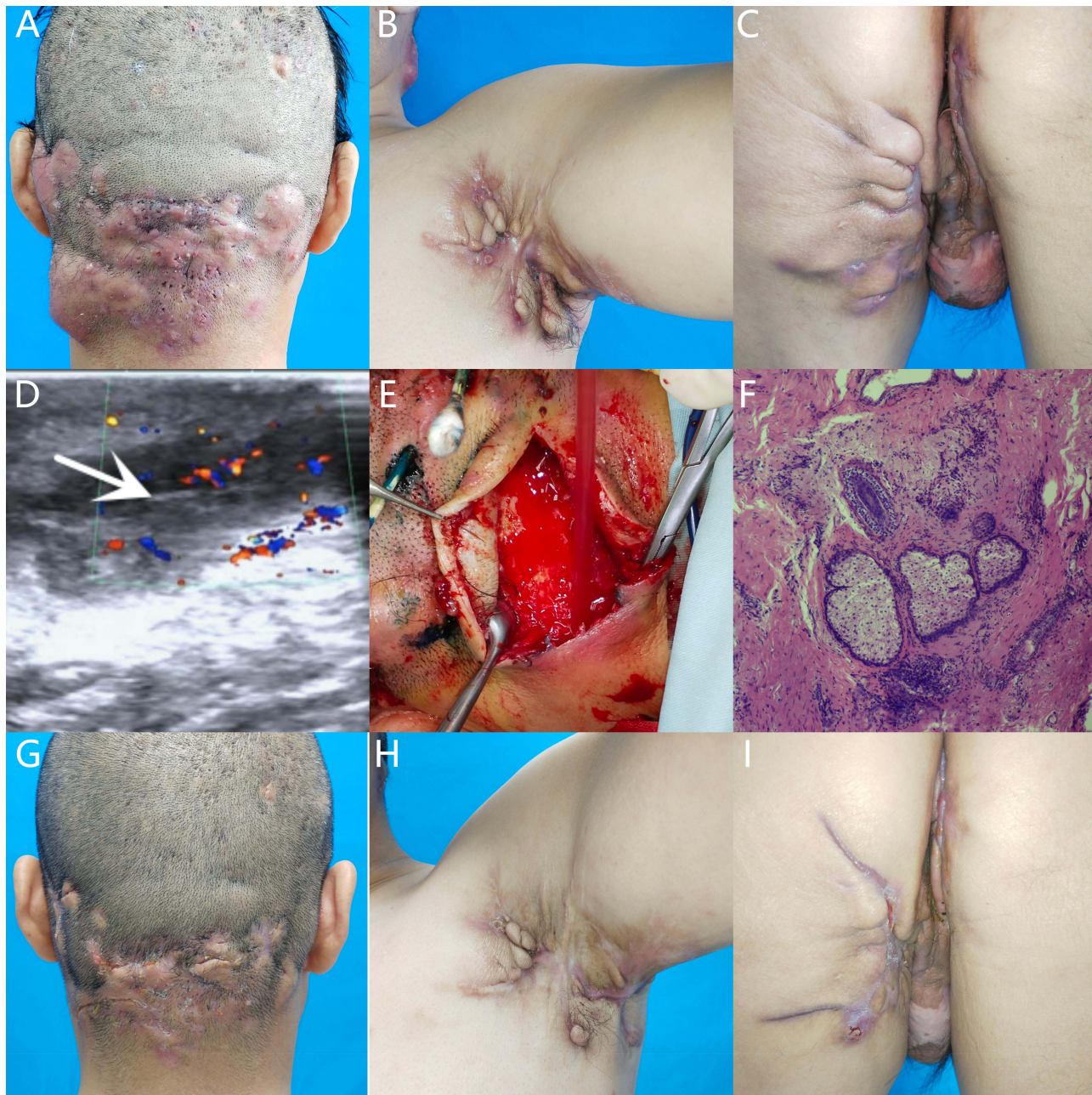
Figure 1 Lesional pictures of the patient. (A) There were multiple nodules, papules and abscesses in the occipital region. The abscesses were subcutaneously connected, and with fluctuation feeling. Purulent and smelling secretions were discharged. (B) Multiple hypertrophic scars, ulcers, and sinus tracts could be seen in the left armpit. Scar contracture restricted the patient's upper limb abduction and lifting activities. (C) Multiple abscesses, sinus formation, and scar hyperplasia were observed in the buttocks and perineal area. (D) Ultrasonographic examination of the occipital region, buttocks, and armpits revealed strong echoes of hair. The white arrow indicated hair with strong echoes under ultrasonographic examination. (E) Hair was found in the abscess cavity during surgery. (F) Pathological examination of one lesion revealed hyperplasia of subepidermal fibers, fat, and vascular tissues with collagen fibers. Local epidermal cysts formed with suppurative inflammation. Local squamous epithelial hyperplasia was accompanied by neutrophils, lymphocytes, histiocytes, and multinucleated giant cells. (G–I) The patient healed well after surgery and the 10-month follow-up revealed no recurrence.

Owing to the complexity of the patient's condition, we adopted a comprehensive treatment method involving medication, surgery, and negative-pressure drainage. Before surgery, the patient was injected with insulin to control blood glucose levels. Bacterial culture of secretions from the wounds showed mixed growth of Zurich actinomycetes and Escherichia coli . The patient received intravenous injections of ampicillin and metronidazole before and after surgery. Ultrasonographic examination of the occipital region, buttocks, and armpits revealed thickening of the subcutaneous superficial fascia and