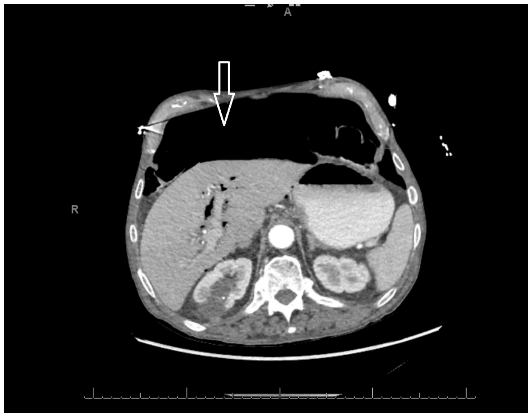
FIGURE 1: Axial CT scan of patient on admission showing free air in the peritoneal cavity (solid arrow)

A 72-year-old African American male presented to the emergency department from the outpatient oncology office with a week of mild abdominal pain, which was not life-threatening. His past medical history was notable for metastatic pancreatic adenocarcinoma, which had been diagnosed one year earlier, from endoscopic retrograde cholangiopancreatography (ERCP) brushings when he presented with obstructive jaundice and required biliary and duodenal stent placement at the time. He had undergone a routine CT scan of his abdomen and pelvis for disease progression two days prior to admission, which revealed a massive pneumoperitoneum (Figures 1, 2). The ominous imaging prompted his admission to the hospital. On presentation to the emergency department, he was in no distress with a blood pressure of 126/85 mm Hg, pulse rate of 93 beats per minute, respiration rate of 18 breaths per minute, and a temperature of 36.9° C. Physical examination was significant for marked abdominal distension with a benign non-peritonitic exam and mild tenderness on palpation. Laboratory tests were unremarkable, except for a white blood cell count of 10.5 \times 10^3/\mu\text{L} with neutrophil predominance (83%). A repeat CT scan showed patent biliary and duodenal stents without a definite source of perforation; however, three suspicious locations were noted by the radiologist containing small foci of free air adjacent to the bowel.